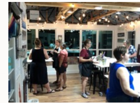
5 Indoor large tables

Call or email and book per the hour. We accept a minimum of 1 hour booking. Over 3 hours would be $100 per additional hour. You would be responsible for advertising and booking your own guests. The room can be laid out as per your requirements. Outdoor space is available at the front.