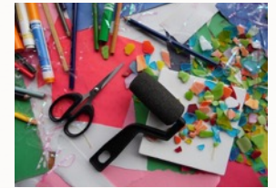
Bring your own supplies

- AMPLE CAR PARKING- NIGHT TIME AMBIENT LIGHTING - FULL KITCHEN - CONTACT US -