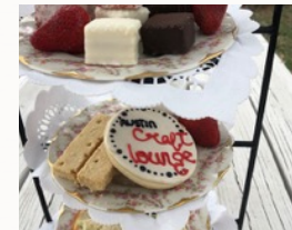
You can bring your own food and drink

Arrange your event with our staff, we will create a ticket online in our website and your customers can book a space online for the class. You will provide all the materials and will be responsible for advertising but we will put the event on our Calendar and Facebook Page. We will pay you 70% of ticket sales. The room can be laid out as per your requirements. Outdoor space is available